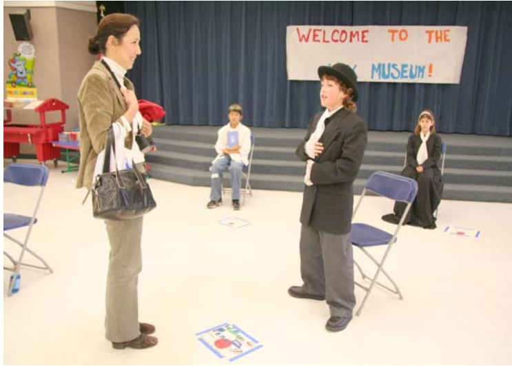
Wax Museum Figure, William Penn