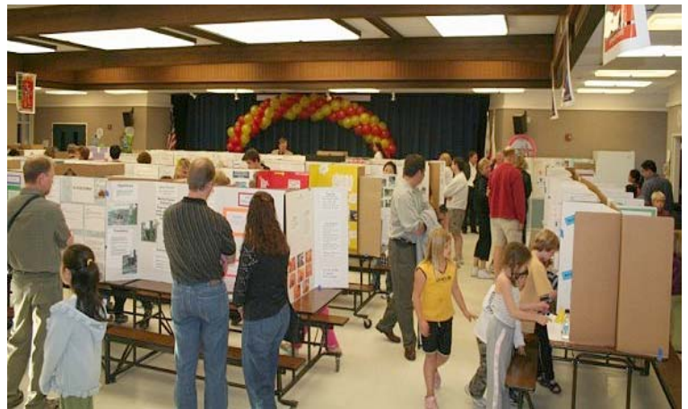
Upper Grade Science Fair