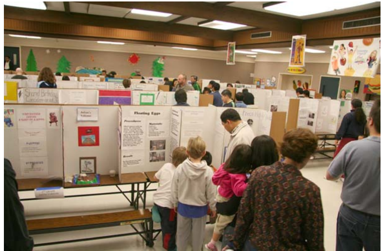
K-3 Science Fair Night

And don't forget! The 4/5 Science Fair is coming up on April 5!