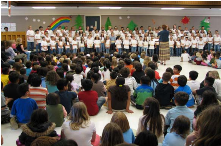
Third Grade Performance